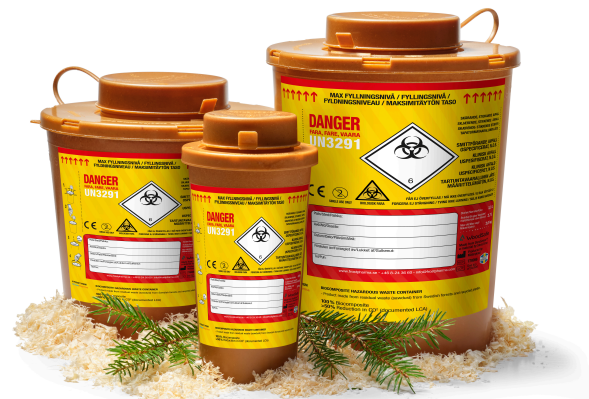
LCA - WoodSafe® vs PP